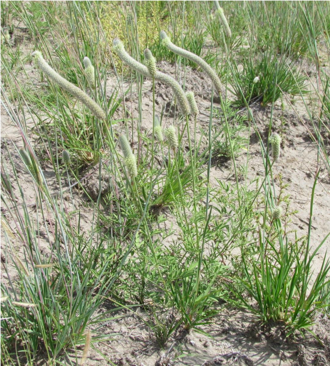
Figure 1: Dalea cylindriceps , Sheridan County, Nebraska, 23 August 2013.