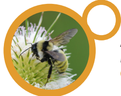
AMERICAN BUMBLE BEE Bombus pennsylvanicus GARDEN IN THE GLEN