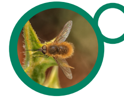
BEE FLY Bombylius major COLORBURST GARDEN AREA