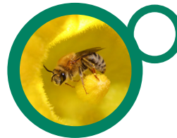
SQUASH BEE Peponapis pruinosa CHILDREN'S GARDEN