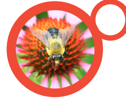
BROWN-BELTED BUMBLE BEE Bombus griseocollis HERB GARDEN