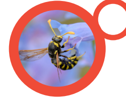
POLLEN WASP Pseudomasaris vespoides CONSERVATION DISCOVERY GARDEN