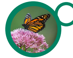
MONARCH Danaus plexippus CONSERVATION DISCOVERY GARDEN