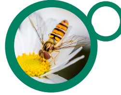
HOVERFLY/SYRPHID FLIES Eupeodes americanus HERB GARDEN