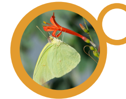
CLOUDLESS SULPHUR Phoebis sennae COLORBURST GARDEN AREA