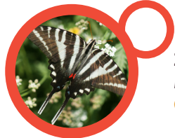
ZEBRA SWALLOWTAIL Eurytides marcellus GARDEN IN THE GLEN