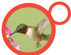
RUBY-THROATED HUMMINGBIRD Archilchus colubris ROSE GARDEN TURN-AROUND