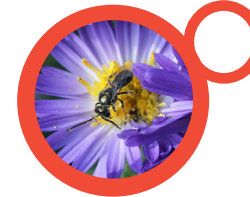
SMALL CARPENTER BEE Certina strenua ROSE GARDEN