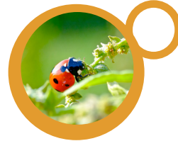
LADYBUG Coccinella sp. CHILDREN'S GARDEN