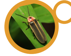
COMMON EASTERN FIREFLY Photinus pyralis COLORBURST GARDEN AREA