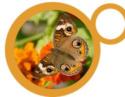
COMMON BUCKEYE Junonia coenia FOUNDERS' GARDEN