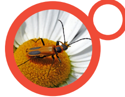
GOLDENROD SOLDIER BEETLE Chauliognathus pennsylvanicus CHILDREN'S GARDEN