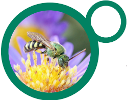
GREEN SWEAT BEE Augochlora pura ENGLISH PERENNIAL BORDER