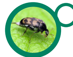
TUMBLING FLOWER BEETLE Glipa oculata STORZ GAZEBO