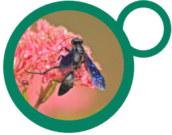
BLUE MUD DAUBER Chalybion californicum POLLINATOR GARDEN