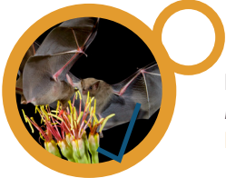
LESSER LONG-NOSED BAT Leptonycteris yerbabuenae FESTIVAL GARDEN