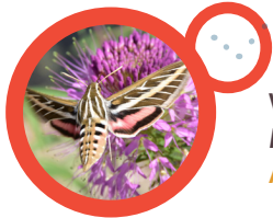
WHITE LINED SPHINX MOTH Hyles lineata ARRIVAL GARDEN