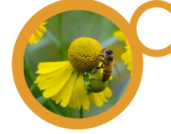
SUNFLOWER BEE Melissodes agilis SONG OF THE LARK MEADOW